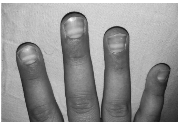
Fig. 2. Nail lesions with the formation of transverse Meesstripes in a patient with acute thallium poisoning (Almassri I., Sekkarie M., 2018) [6].

The analysis of literature data and own experience of treatment of 6 patients with acute Tl^+ poisoning [5] shows that treatment of intoxications with this toxicant should be aimed primarily at removing waist from the body: in early hospitalization – gastrointestinal lavage with enterosorbents (activated charcoal, C carbolong, KAU, etc.), intestinal lavage or enema with hypertonic solution, as well as the appointment of sorbitol 25 g 3-4 times a day to cause hyperosmolar diarrhea, forced diuresis with mandatory monitoring of potassium and sodium levels in blood plasma. At the same time, potassium iron hexacyanoferrate (ferrocin, Berlin azure, Prussian blue) is used as antidote therapy. It is the most effective in the first 1-3 days [12, 18, 19, 29, 34, 35, 42]. By the way, its positive effect has been proven in the