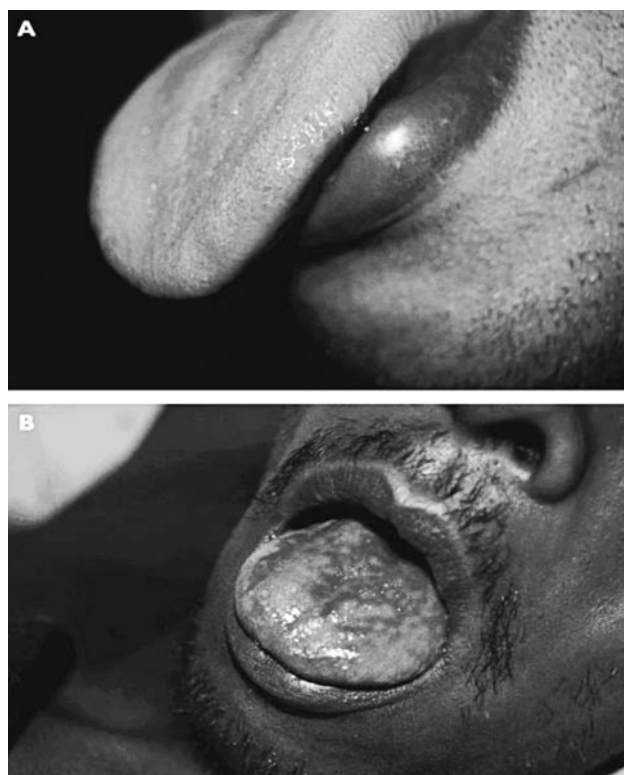
Fig. 1. A) early involvement of the tongue 24 hours after exposure to paraquat; B) late lesions of the tongue with large ulcers 2 weeks after exposure to paraquat (I.B. Gawarammana, N.A. Buckley, 2011) [8].

The mechanism of the toxic action of bipyridyl herbicides, especially paraquat, is due to their super-high prooxidant activity. Superoxide radicals, which are formed, disrupt the structure of the lipid matrix of the cell membrane as well as of mitochondria and cause hypoxia [26-29, 32-35]. Development and energy deficit of pronounced early (after 4–7 hours) destructive changes caused by paraquat in alveolar epithelial cells i.e. type I and especially type II pneumocytes, happen due to the high affinity of this herbicide to these pneumocytes.