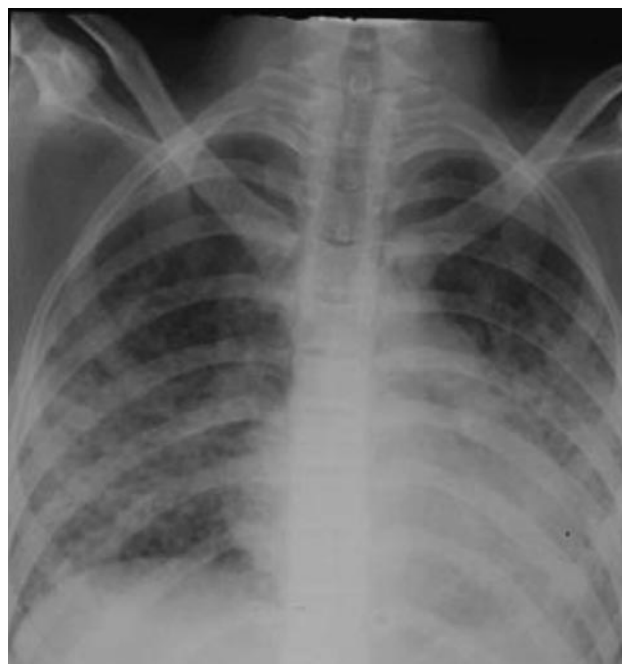
Fig. 2. Chest X-ray of the patient showing diffuse alveolar lesions 7 days after exposure to paraquat (I.B. Gawarammana, N.A. Buckley, 2011) [8].

In our Centre (formerly the All-Union Scientific Research Institute of Hygiene and Toxicology of Pesticides, Polymer and Plastics), back in 1972, V.N. Makovsky completed the dissertation “Toxicological studies of bipyridyl herbicides (diquat and paraquat)” [15]. The author showed that paraquat is a potent poisonous substance for most species of warm-blooded animals (LD 50 for guinea pigs is 42 mg/kg, for white mice is 56 mg/kg, for white rats is 128 mg/kg), while diquat is highly toxic (LD 50 for these animals is 100, 86 and