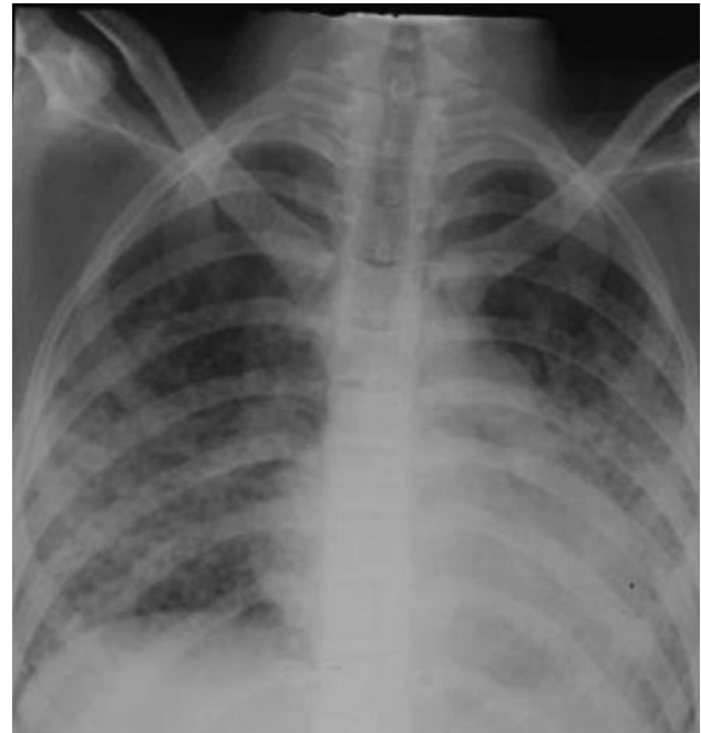
Fig. 2. Chest X-ray of the patient showing diffuse alveolar lesions 7 days after exposure to paraquat (I.B. Gawarammana, N.A. Buckley, 2011) [8].

In our Centre (formerly the All-Union Scientific Research Institute of Hygiene and Toxicology of Pesticides, Polymer and Plastics), back in 1972, V.N. Makovsky completed the dissertation "Toxicological studies of bipyridyl herbicides (diquat and paraquat)" [15]. The author showed that paraquat is a potent poisonous substance for most species of warm-blooded animals (LD50 for guinea pigs is 42 mg/kg, for white mice is 56 mg/kg, for white rats is 128 mg/kg), while diquat is highly toxic (LD50 for these animals is 100, 86 and