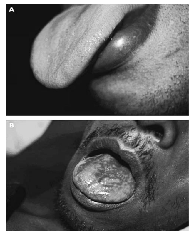
Fig. 1. A) early involvement of the tongue 24 hours after exposure to paraquat; B) late lesions of the tongue with large ulcers 2 weeks after exposure to paraquat (I.B. Gawarammana, N.A. Buckley, 2011) [8].

The mechanism of the toxic action of bipyridyl herbicides, especially paraquat, is due to their super-high prooxidant activity. Superoxide radicals, which are formed, disrupt the structure of the lipid matrix of the cell membrane as well as of mitochondria and cause hypoxia [26-29, 32-35]. Development and energy deficit of pronounced early (after 4–7 hours) destructive changes caused by paraquat in alveolar epithelial cells i.e. type I and especially type II pneumocytes, happen due to the high affinity of this herbicide to these pneumocytes.